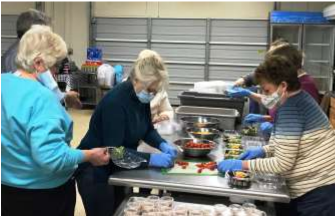
Meals will be prepared by Central Baptist Church in May and Reward United Methodist Church in June.